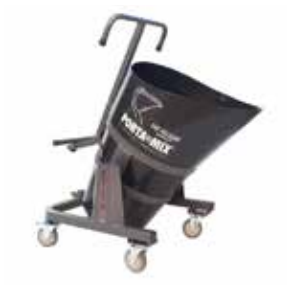
Pelican - Transport Cart