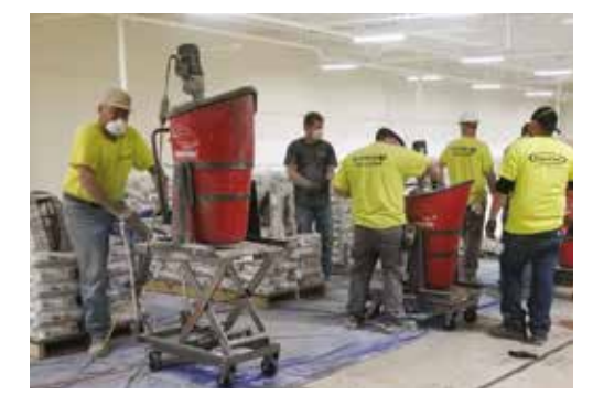
TRU® Self-Leveling – Mixing with a strainer